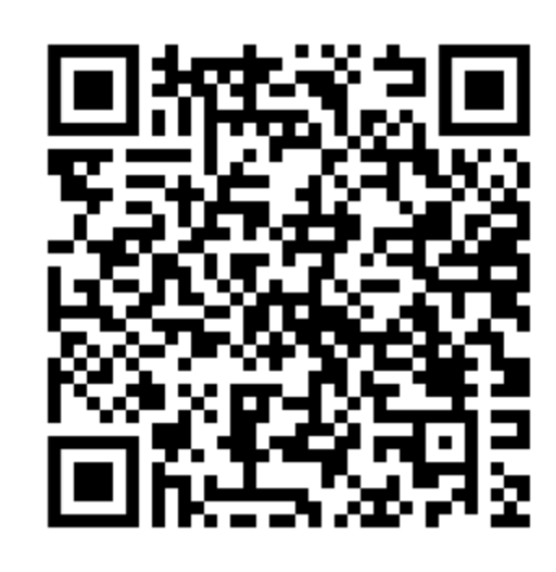
QR Code for Tahoe Area Plan Update Website